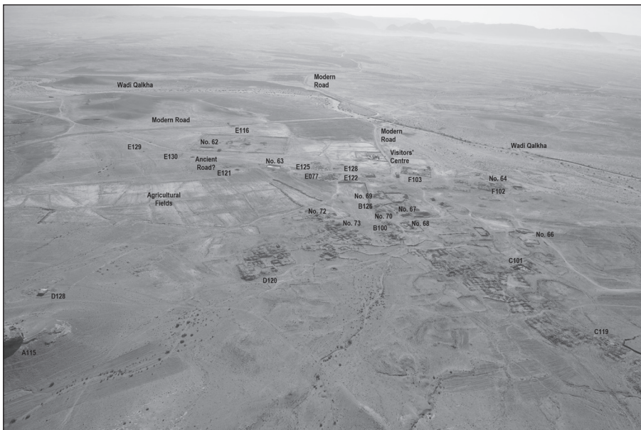
4. 2016 helicopter photograph facing east with labels added for buildings and features studied by the Al Humaymah Excavation Project. (APAAME_20160919_DLK-0097. Labels added by M. B. Reeves.)