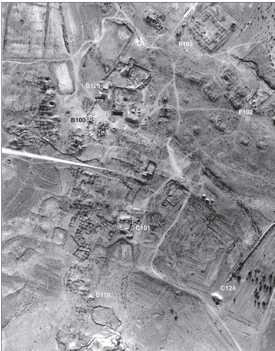
3. 1992 balloon photograph with locations marked for excavated churches (B100, B126, C101, C119, F102), Abbasid qasr (F103), and Nabataean campground (C124).

Craig A. Harvey Department of Classical Studies The University of Western Ontario London, ON, Canada craig.harvey@uwo.ca